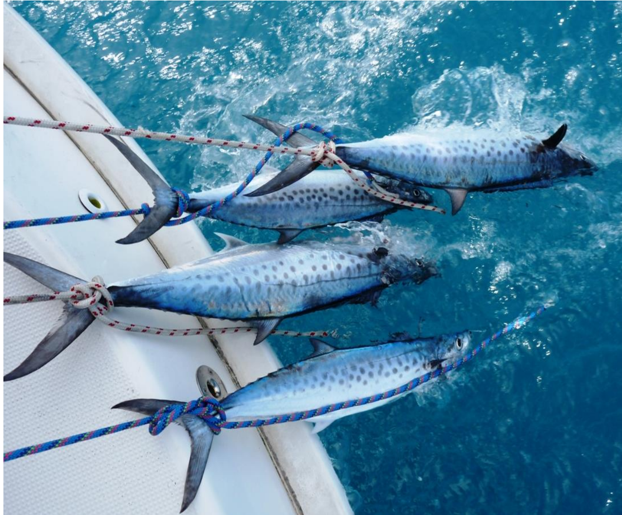
Towing Spotted mackerel after bleeding