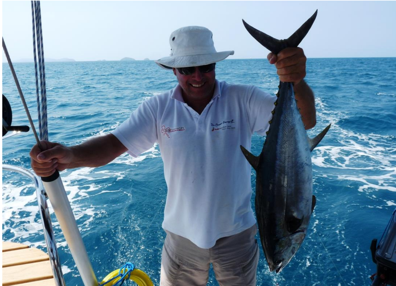
Yellow Fin Tuna