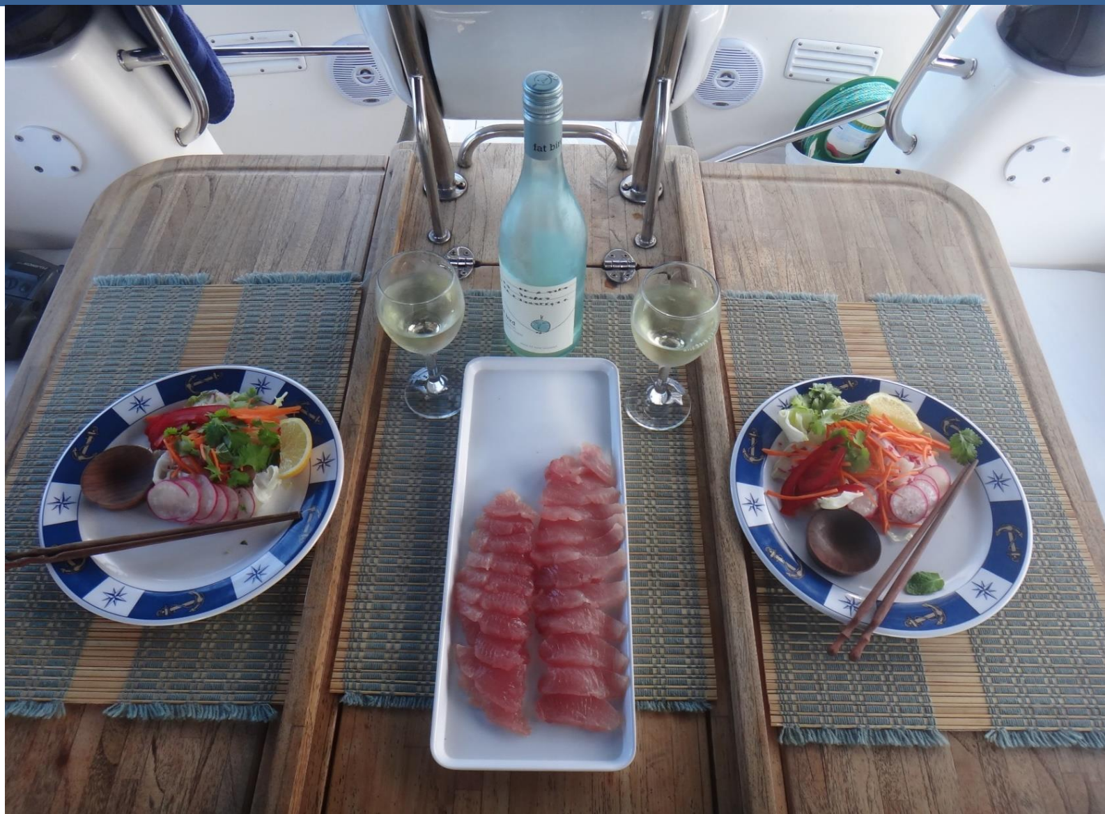
Yellow Fin - Sashimi