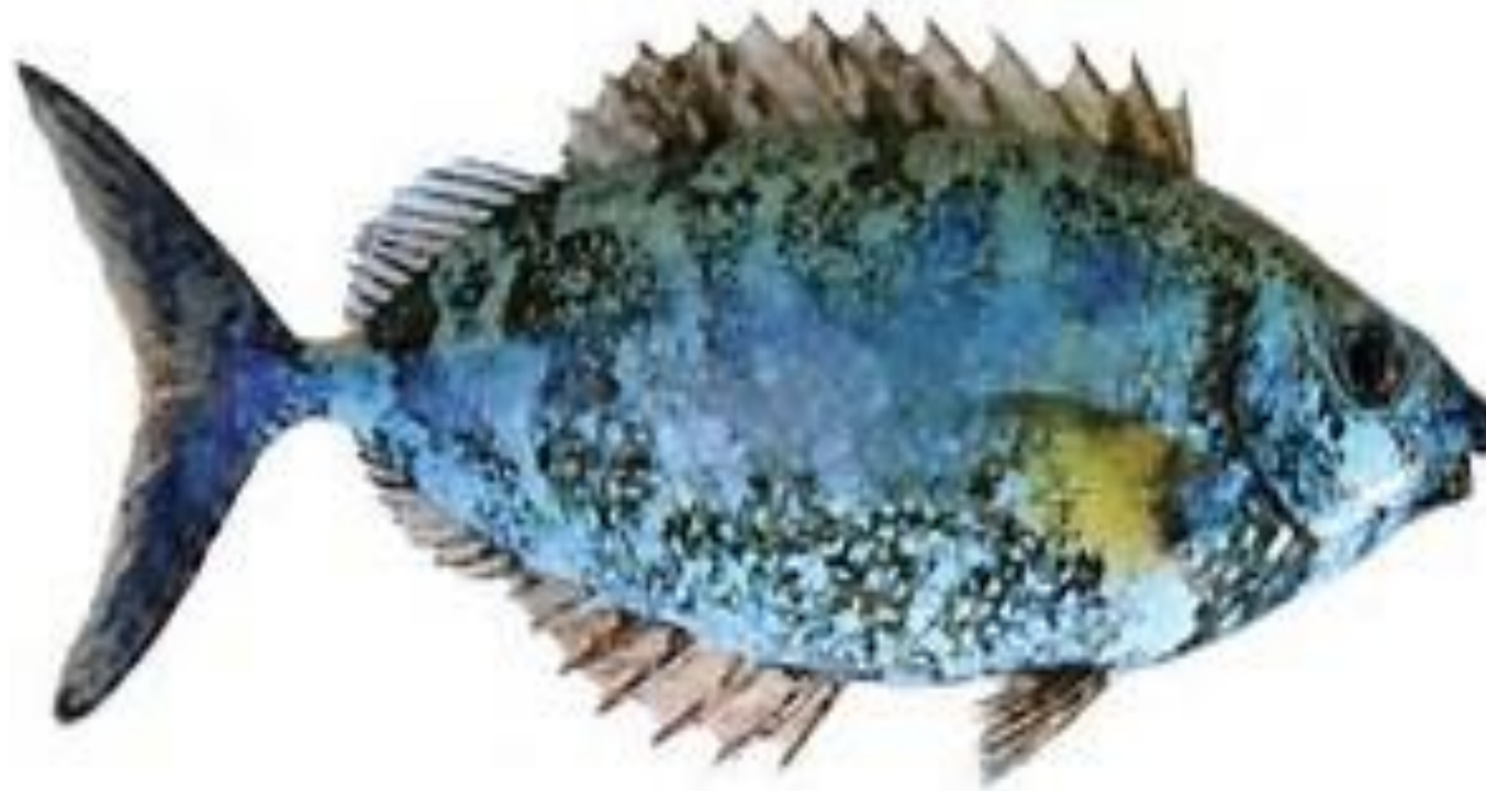
“Happy Moments “ - Smudgespot Spinefoot