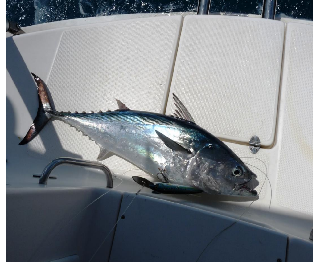
Blue Fin Tuna