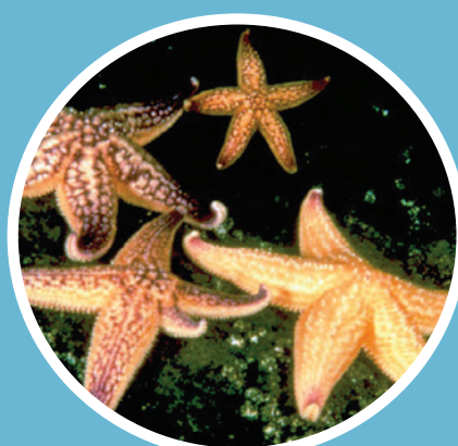
Northern Pacific Seastar

These marine pests are not known to occur in NSW: