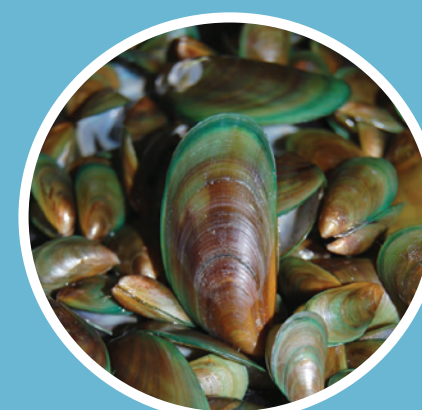
Asian Green Mussel