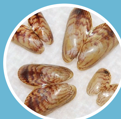
Asian Date Mussel