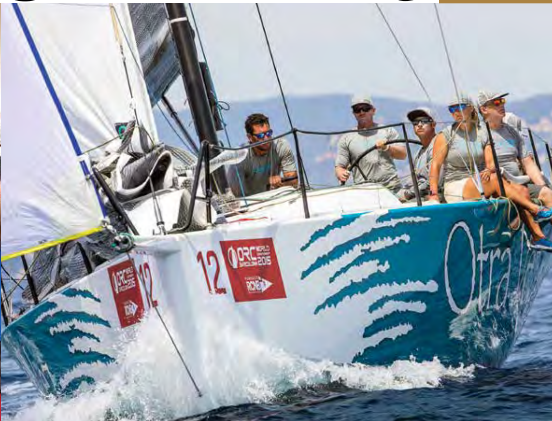
BARCELONA ORC WORLD CHAMPIONSHIP (4)