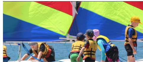
Kids Learn to Sail