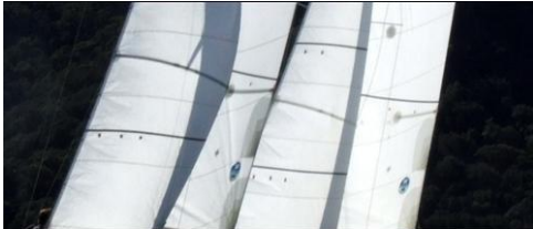
Adult Keelboat Program

Be introduced to sailing for the first time or develop racing and spinnaker skills on the Club's fleet of Elliot 7s!